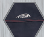
customer logo option available