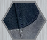
special flame-resistant thread