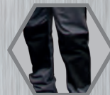
reinforced knee pads