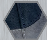
special flame-resistant thread