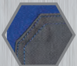
special flame-resistant thread