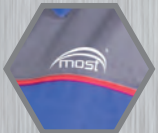
customer logo option available