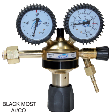
BLACK MOST Ar/CO 2