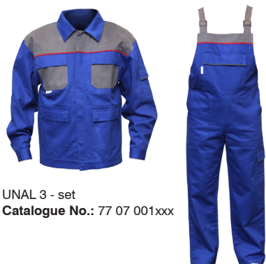
UNAL 3 - set Catalogue No.: 77 07 001xxx