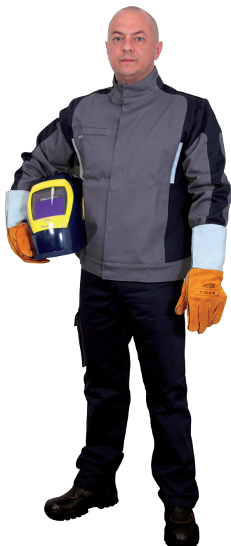
Option with short jacket