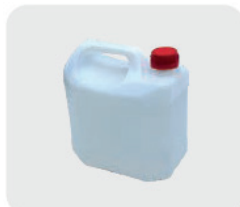
Coolant liquid 10 l (Cat. No. 59 K0 090015)