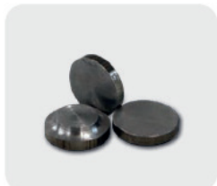
Spare focus core 32 mm (Cat. No. 59 K0 090014)